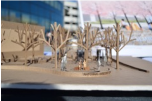
Assembly Center Rendering

internationally known architectural firm, RHAA. RHAA is most known for creating the design and renovation of Union Square in San Francisco.