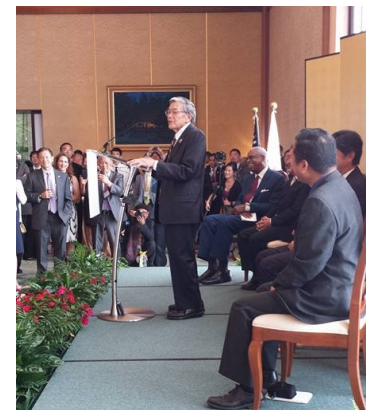
Secretary Norman Mineta