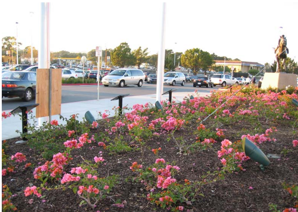
The plaque as it exists is an insignificant reminder of a gross violation of constitutional rights

The internment of U.S. citizens and immigrants of Japanese ancestry was one of the worst constitutional violations in our country's history. The Commission on Wartime Relocation and Internment of Civilians reported to President Reagan and the Congress in 1983 that the denial of constitutional rights of Japanese Americans during WWII was attributed to "race prejudice, war hysteria, and the failure of political leadership." With this letter, San Mateo chapter pledges to work to memorialize the site at Tanforan.